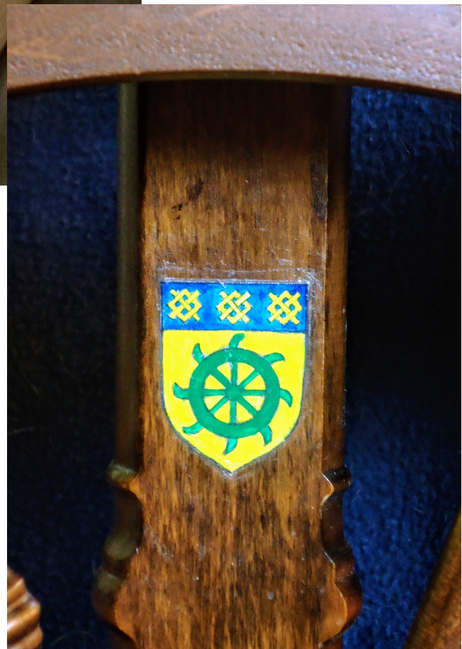
Right: Spinning wheel decoupage with the device of Scholastica la souriete