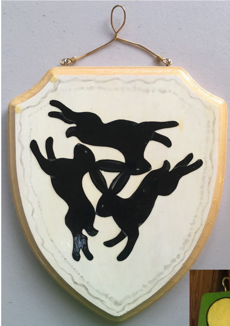
Left: Wooden plaque with paint and decoupage, displaying the device of Elvira Pedrosa