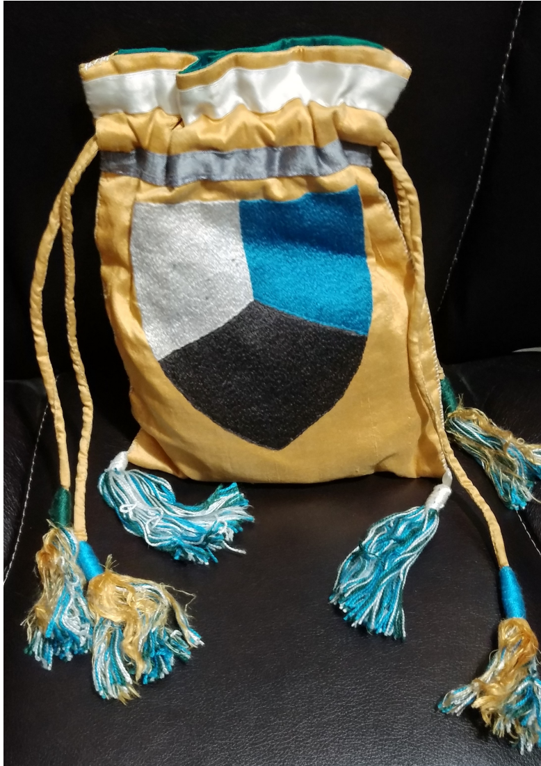
Left: Silk pouch embroidered with the badge of Beatrice Domenici della Campana