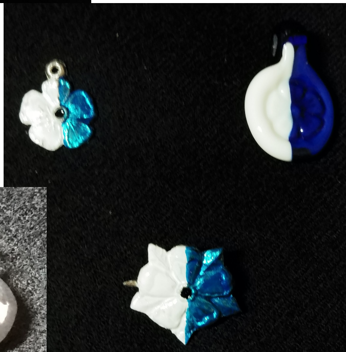
Below: a badge need not be an image; these bells represent the registered badge " (Fieldless) A hawk's bell argent. " (Beatrice Domenici della Campana)