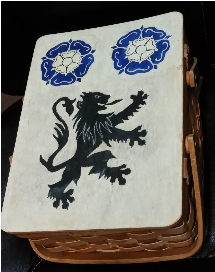
Left: Feast gear basket painted with the badge to Beatrice Domenici della Campana