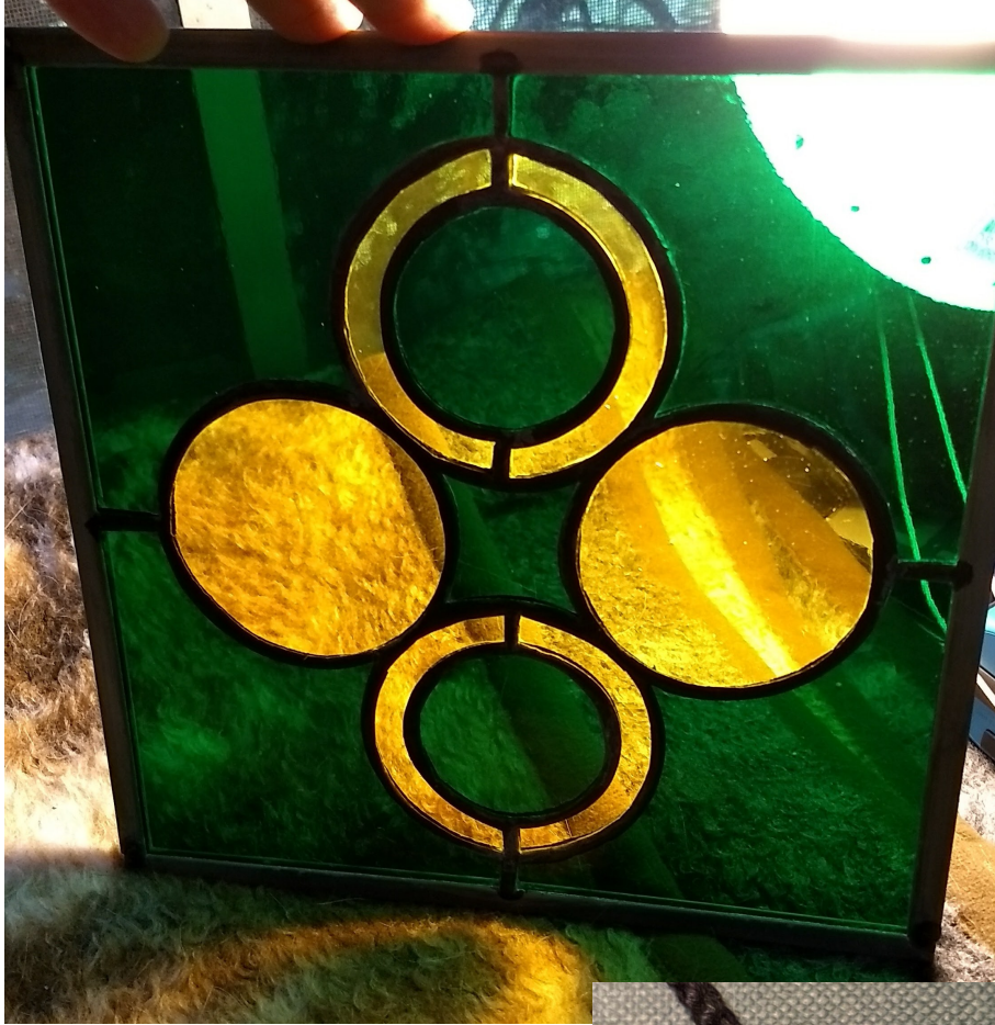
Above: Stained glass badge of Groza Novgorodskaia