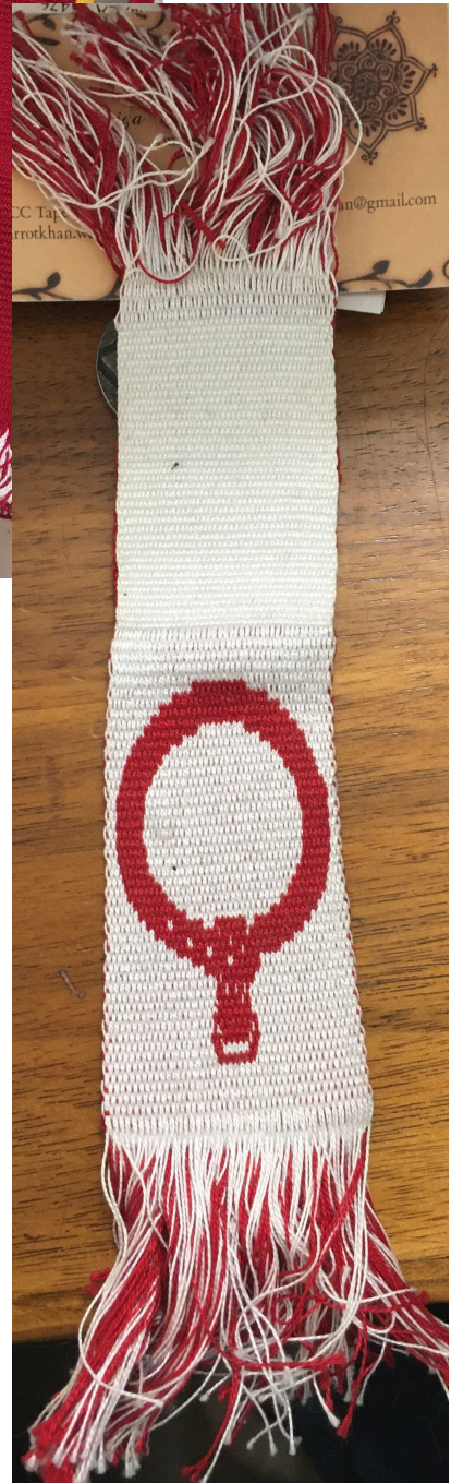
Right: Tablet-woven belt favor displaying the badge of Herveus d'Ormonde