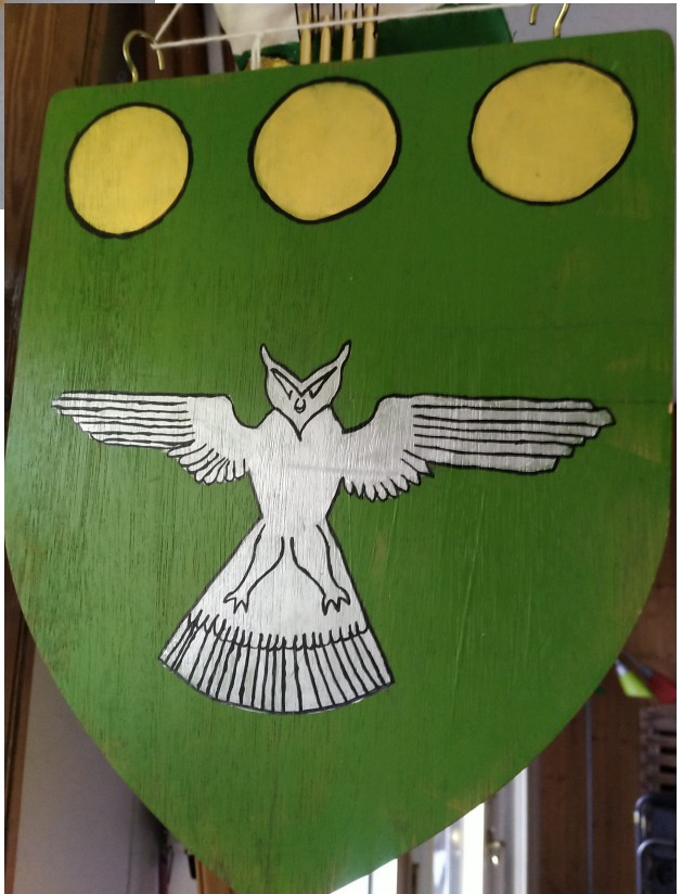
Right: Wooden escutcheon displaying the device of Groza Novgorodskaja