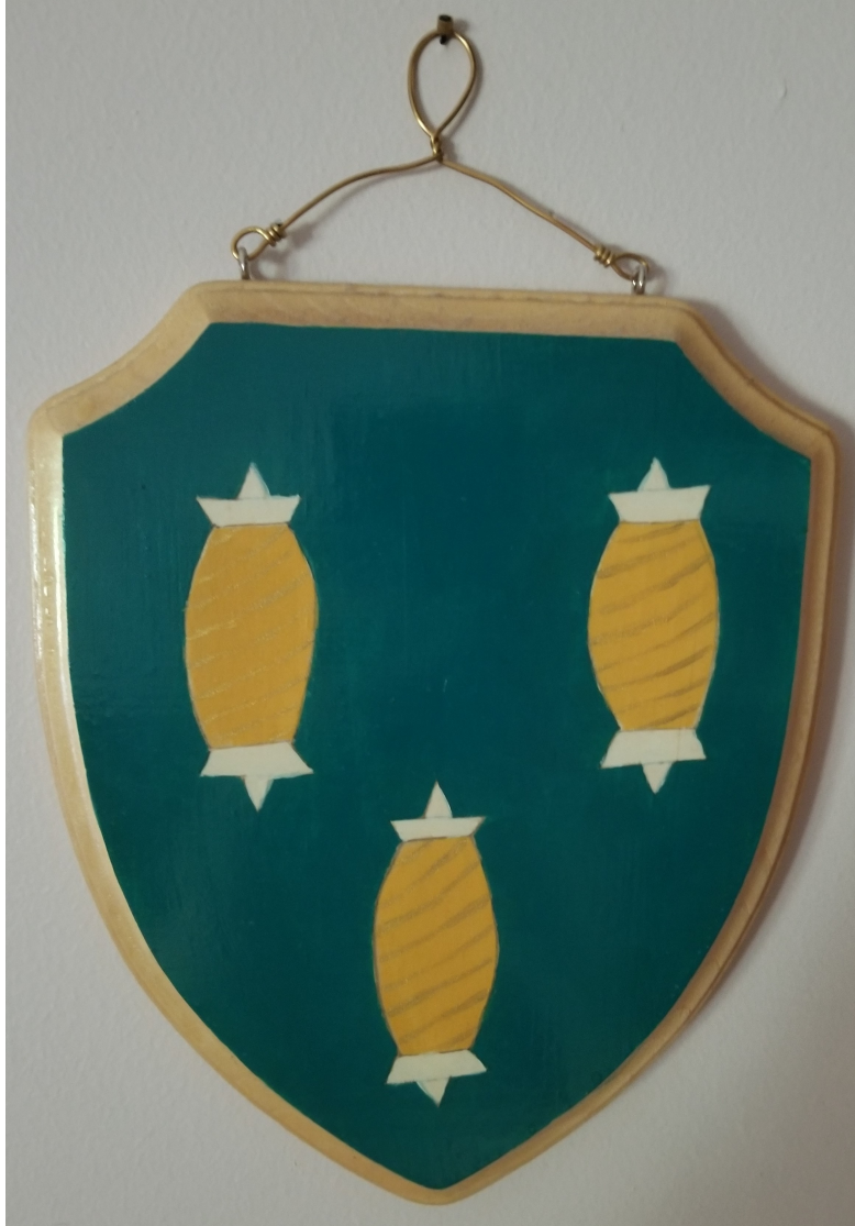
Left: Wooden plaque painted with the device of Molda ókristna Starradóttir