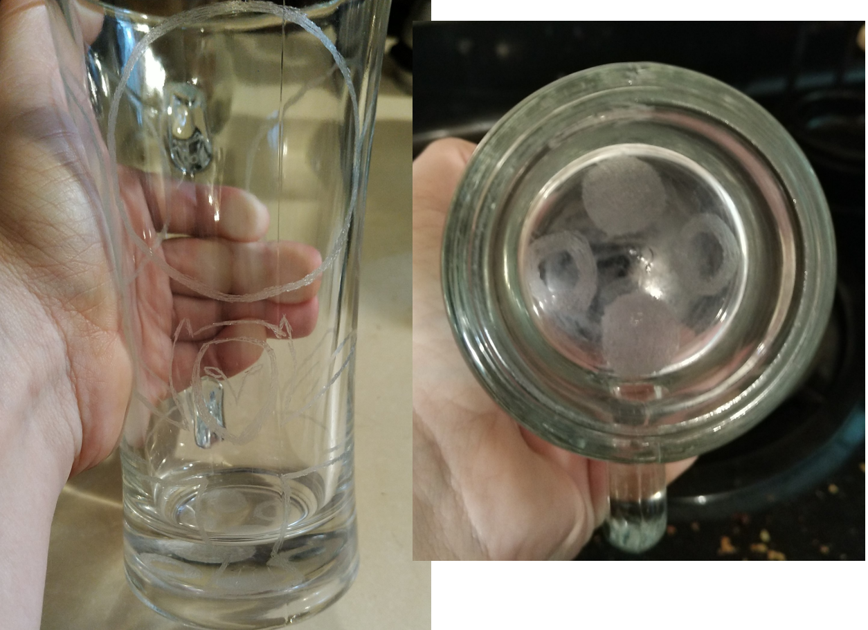
Above: Glass mug etched with the device (side) and badge (bottom) of Groza Novgorodskaia