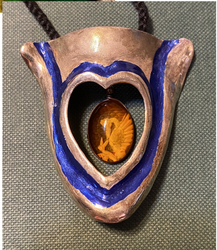
Right: Pelican medallion within a brooch depicting the badge of Lillia de Vaux