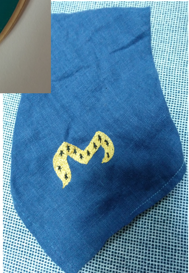
Right: Linen favor embroidered with the badge of Beatrice Shirwod