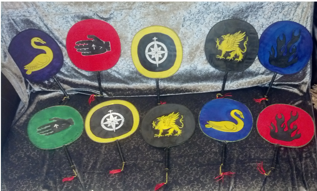
Silk fans painted by Beatrice Domenici della Campana