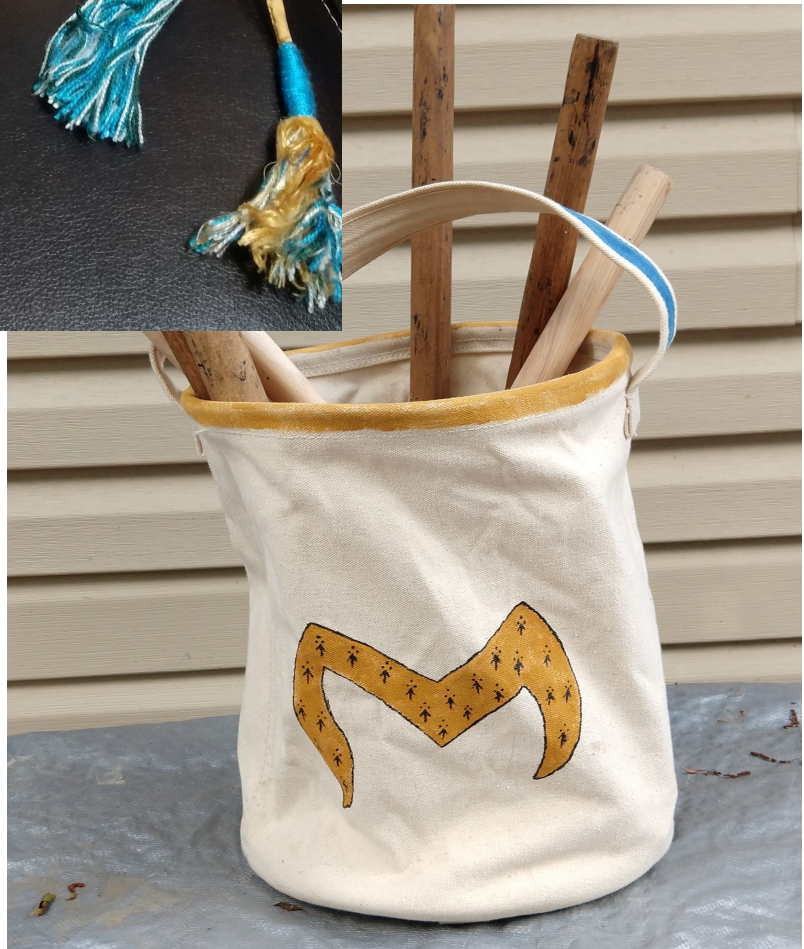
Right: Fieldless badge painted on canvas bucket by Beatrice Shirwod