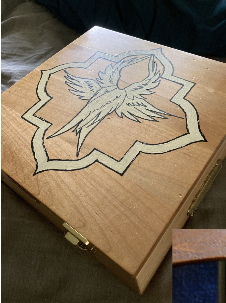
Left: Coronet box painted with the badge of Konstantia Kaloethina