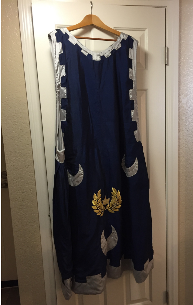
Left: Sideless surcoat displaying the arms of Caid, worn in lieu of a herald's tabard