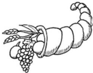
A cornucopia effluent