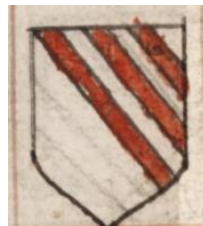
Three bendlets enhanced (period)