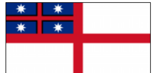
United Tribes of New Zealand 3