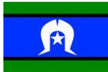
Torres Strait Islander