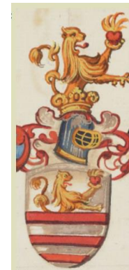
Period examples of a heart enflamed to chief .