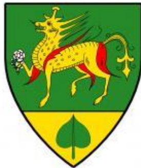
Vert, a qilin passant Or maintaining a peony argent, on a base Or a linden leaf vert.